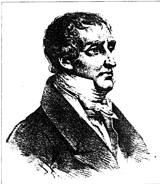
Antoine-Francois de Fourcroy

By contrast, the reform of nomenclature became a feature of normal science in the late nineteenth-century with the institution of regular international conferences. Following the first International Conference of Chemistry held in Paris in 1889, a special section was appointed under the leadership of Charles Friedel (1832-1899), who was in charge of preparing a set of recommendations to be voted during an international conference on chemical nomenclature held in Geneva in April, 1892. The rules were aimed at coordinating the individual attempts made at systematizing the nomenclature of organic compounds. For instance, Williamson introduced parentheses into formulas to enclose the in-