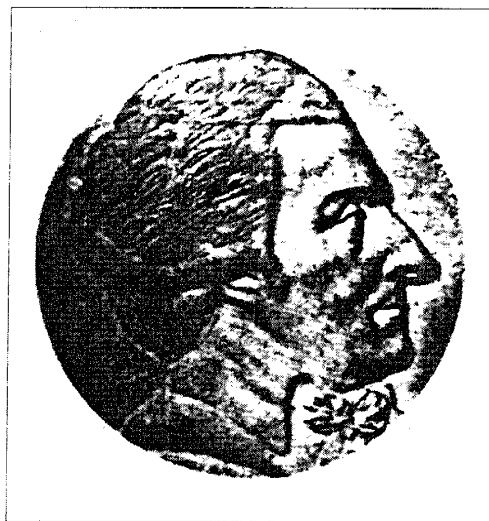
Guyton de Morveau

a lawyer and a well-known chemist from Dijon. In 1782 Guyton authored a bold project for reforming the entire chemical nomenclature(12). His reform was based on the assumption that denominations should reveal "the nature of things," like the botanical nomenclature set up by Carl Linnaeus, although Guyton chose Greek rather than Latin etymologies (presumably because of his